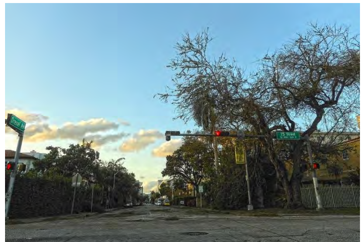
Drexel and 15 th Street, Miami Beach

In the morning hours of September 10, 2017 Irma made a US mainland landfall on Cudjoe Key as a Category 4 hurricane and then made a 2 nd Florida landfall on Marco Island as a Category 3 in the late afternoon. She continued barreling through the State of Florida and weakening into a depression over the Georgia-Alabama border. By 1pm on September 10 there were almost 730,000 customers without power in Miami-Dade County alone. By the end of the day over 2.6 million homes in Florida were without power.