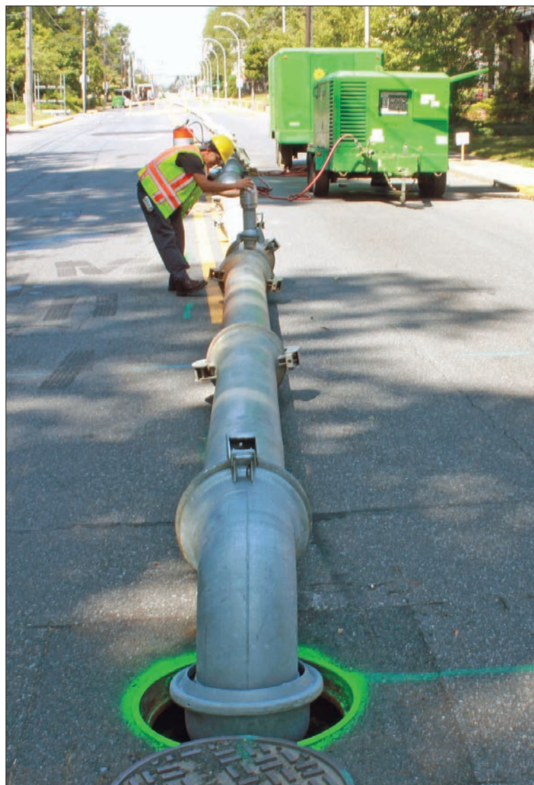
At the end of the mile-long bypass system, a crew member checks the pressure and releases a small amount of air so that the bypass system flows with ease.

Upstream from the project, a pump station discharges into an